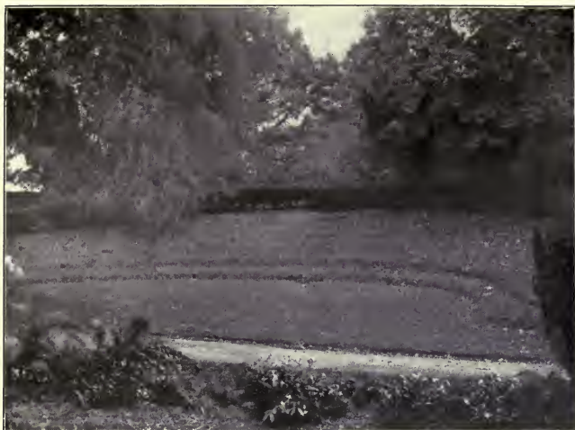
THE DEAN'S CHAIR AT GOSFORD CASTLE